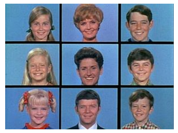
The Brady Bunch Family

This edition of Church Life looks back over the months of November and December of 2020 and looks forward to January and February of 2021. If we were to compare this edition with any other year, we would immediately note so many differences. Instead of photos of worship gatherings in our beautiful sanctuary, or Wednesday Night Live programs and meals in the fellowship hall, or children's or youth gatherings, we instead see photos that have an uncanny resemblance to the opening scene of The Brady Bunch. Remember seeing this?