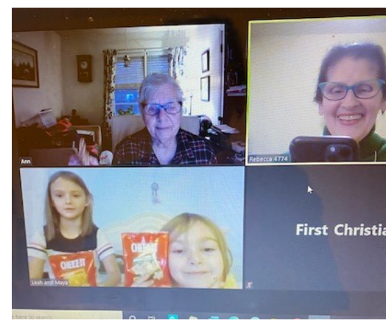
November 22, 2020