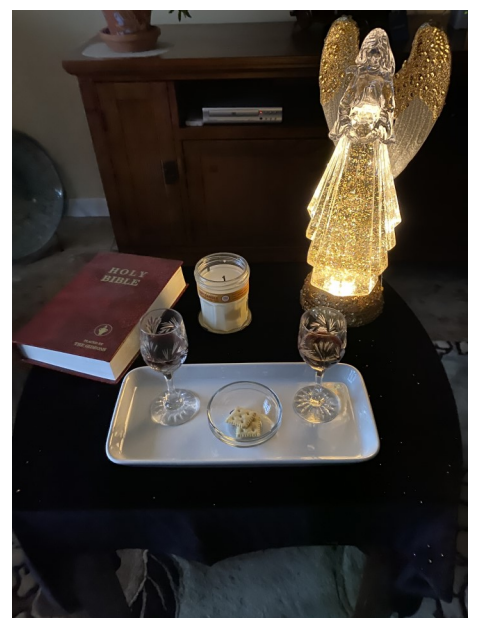
The McAllister's worship center