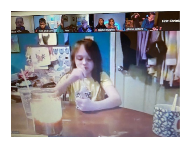
November 29, 2020