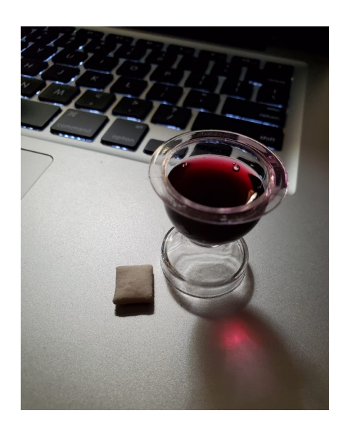
Beth Dobyns posted this on Facebook with caption "We remain connected ..."