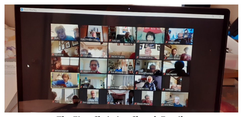
The First Christian Church Family

Nine people in squares all looking out from their own little cubicles of existence as, while the Brady Bunch theme song is playing, it alternates between what we now call "speaker view" and "group view." That's what our Zoom gatherings at First Christian Church now resemble as we meet for 'coffee hour,' worship, Board and Elders meetings, Wednesday Night 'Virtual' Live, special presentations, youth group, and the Sunday children's gathering. This is what one of the screens from last Sunday's worship on December 14, 2020, looked like (you had to scroll over to see the other group of people since those assembled could not fit on one screen):