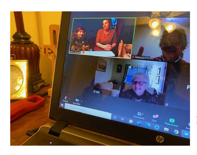
December 6, 2020