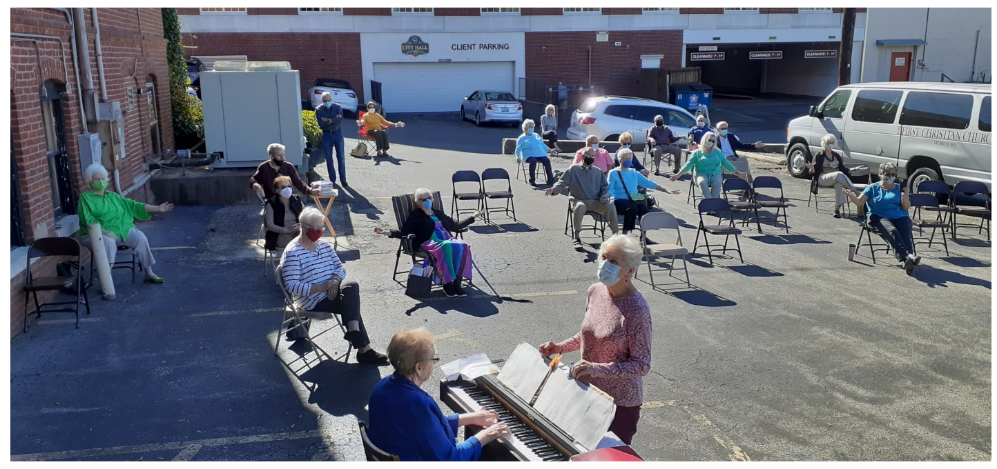
November 8, 2020